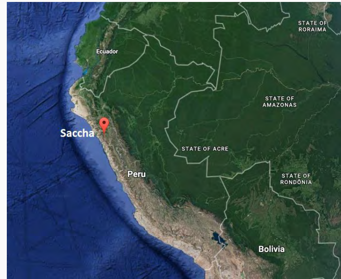
Figure 3. Location of Saccha, Peru 5