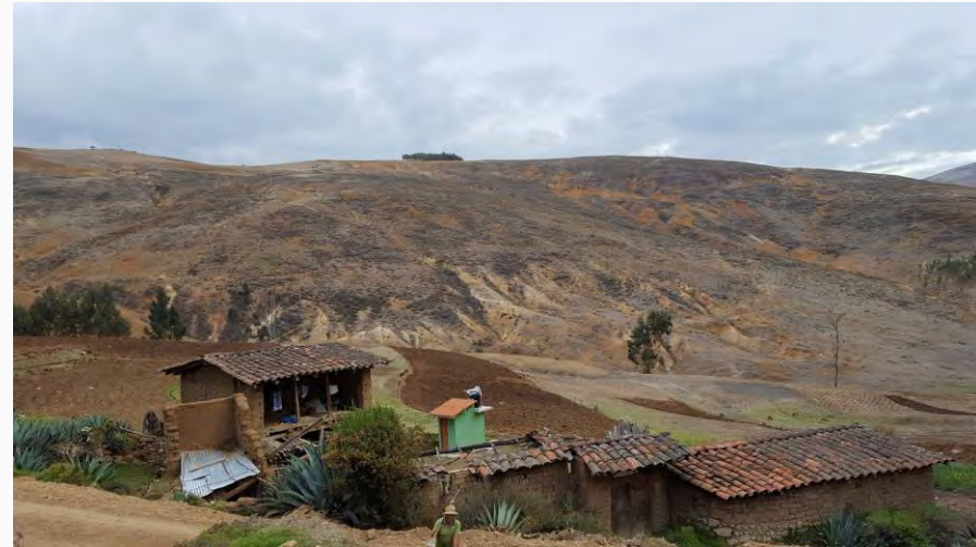
Figure 2. Typical homes in Saccha, Peru 4

Design potable water distribution system for Saccha, Peru