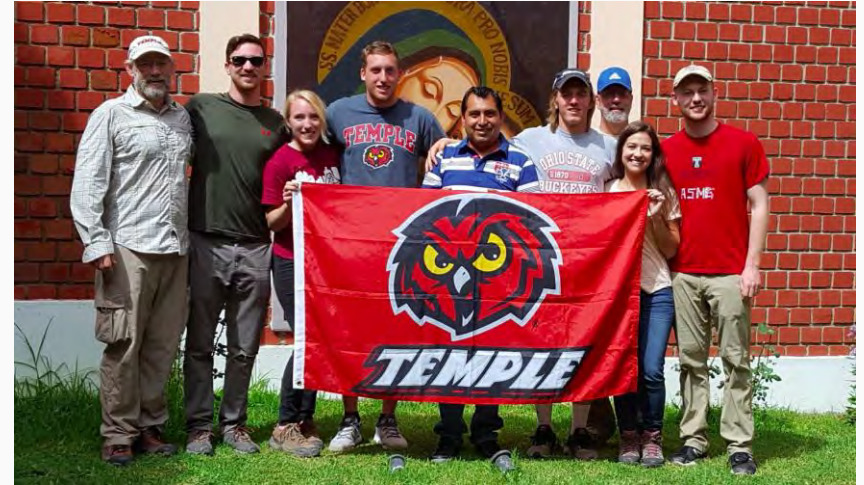
Figure 4. January 2017 travel team