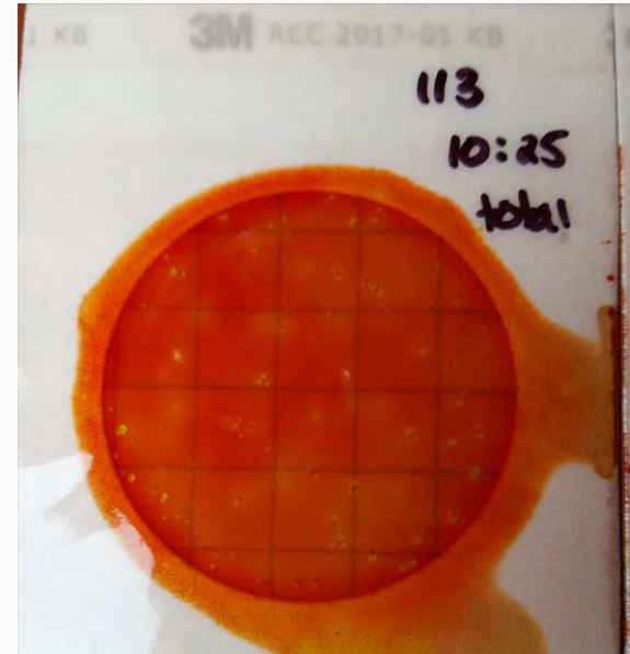
Figure 8. Total coliform field test